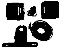
4348 Running Signal Light Kit